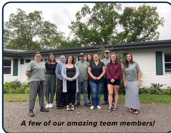
A few of our amazing team members!

Your generosity sustains our mission, ensuring that Five Oaks continues to be a place of growth, healing, and connection. To illustrate the profound impact your donations have, some staff have shared their insights on the Centre and how your support preserves its' future.